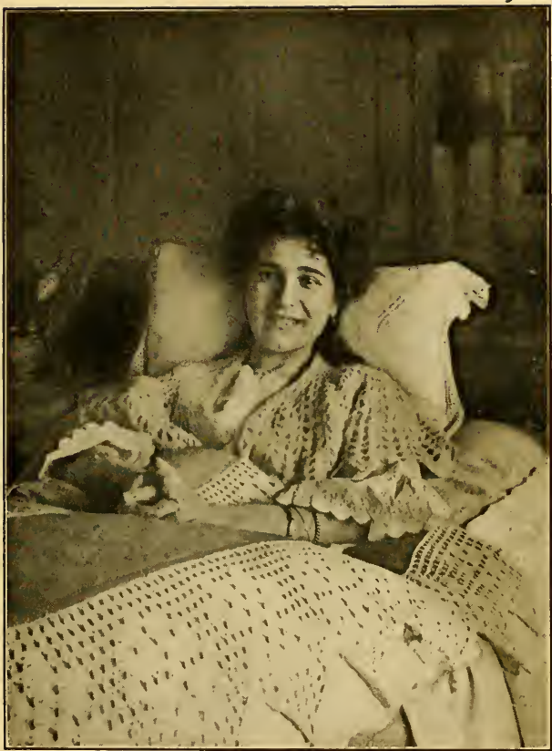
Life and Death Are to Me the Same Joy